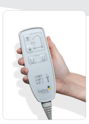
Handset control with battery charging status display.