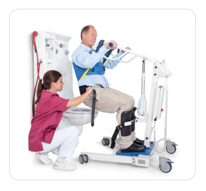
The NORA standing/raising aid offers optimal support and transfer to and from the toilet, especially in small rooms.