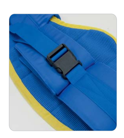
High quality lifting belts available in a range of sizes.