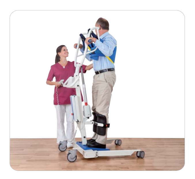
Controlled, slow and safe raising of the patient up to full vertical loading on the legs.

The NORA standing/raising aid avoids back strain on the nurse or care giver, reducing the likelihood of work related sick days. The handset control, the safe and comfortable lifting harness and secure safety belt for each leg all allow the NORA standing/raising aid to be operated by a single carer. In addition, as a result of the smooth movement and special ergonomics of the lifting operation, the back of the patient is preserved allowing both safe and gentle care.