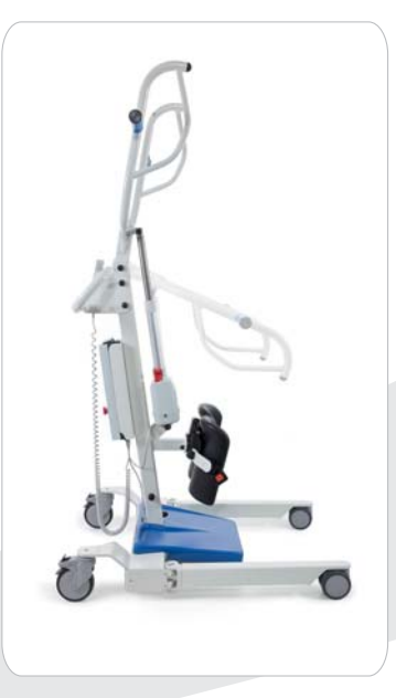
Extra high lifting range, raising your patient to full vertical loading on the legs.