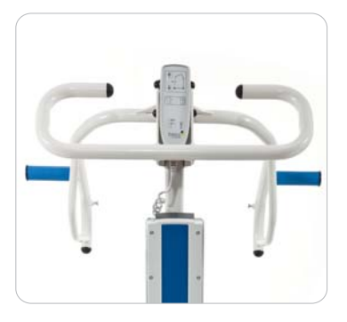
2 Ergonomically designed and positioned handles offering an optimum grip during transfer.