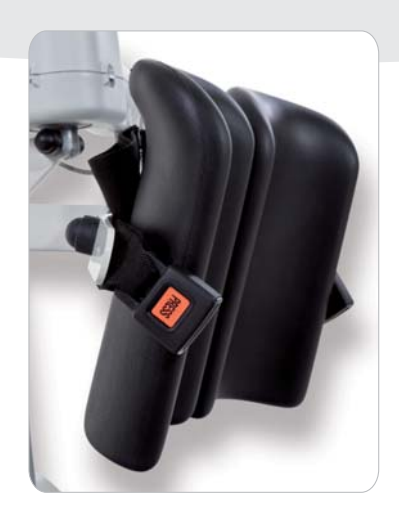
Extra soft knee-pads with individual safety belts, for maximum comfort and safety.