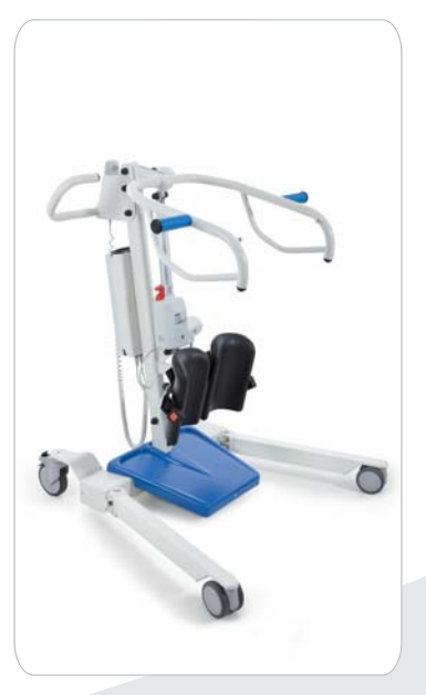
Handset operated electrical spreader frame.