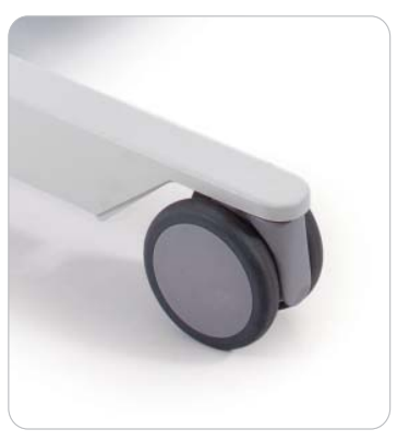
Easy adjustable castors for extra safety.