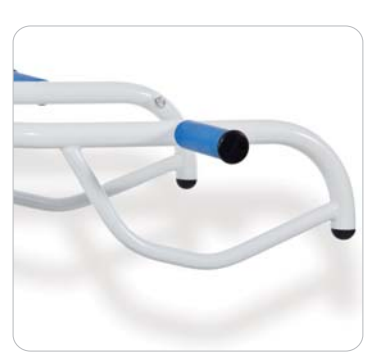
Support handles providing a safe hold for the patient.